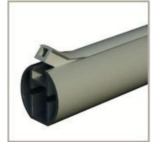
Curtain Rail Dust Strip

Extremely sturdy, high load bearing capacity, made of anodised aluminium with external grooving.