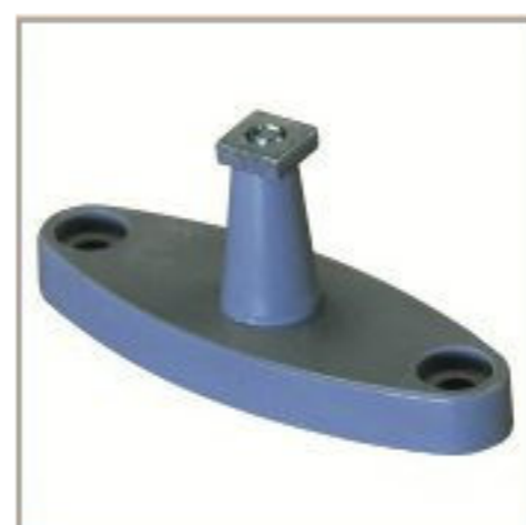
Ceiling Rail Bracket

Straight wall connector element made of glass fibre reinforced plastic.