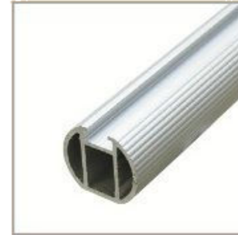
Aluminium Curtain Rail

Curtain ring made of unbreakable polyamide. Releases from the curtain loop in case of overload (approx. 2kg)