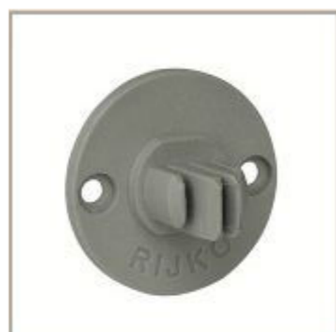
Straight Wall Connector

Adjustable ceiling column ( \pm 2 cm) consisting of powder-coated steel bracket and anodised aluminium section with injection moulded fibre re-inforced plastic cone and stainless steel threaded insert for fastening to the curtain rail.