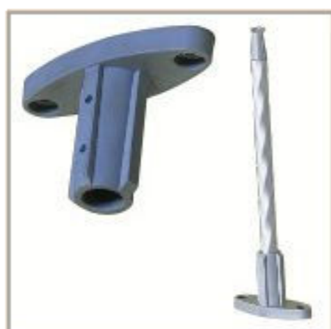
Ceiling Rail Connector