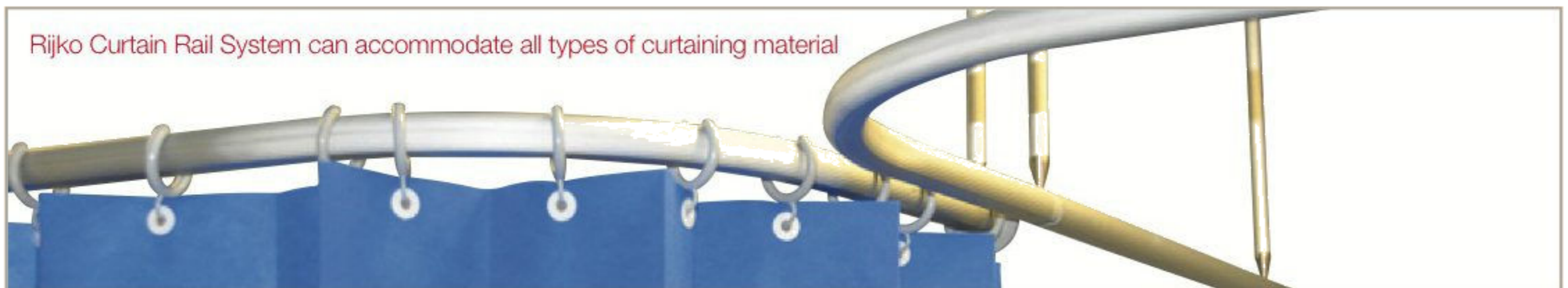
Rijko Curtain Rail System can accommodate all types of curtaining material

Our anodised aluminium curtain rail comes standard with a plastic extruded dust strip to close off the top channel which makes it both hygienic and easy to clean.