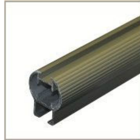
Aluminium Curtain Rail

End caps made of glass fibre reinforced plastic to stop the curtain rings from falling off the rail.