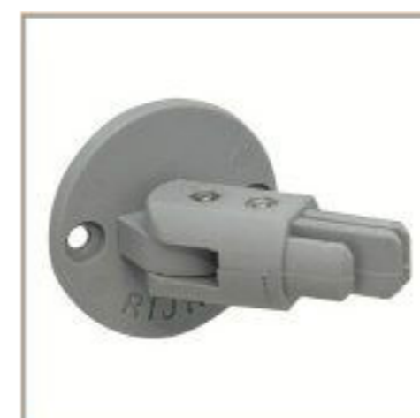
Angled Wall Connector

Ceiling holder made of glass fibre reinforced plastic with injection moulded fibre re-inforced plastic cone and stainless steel threaded insert for fastening to the curtain rail.